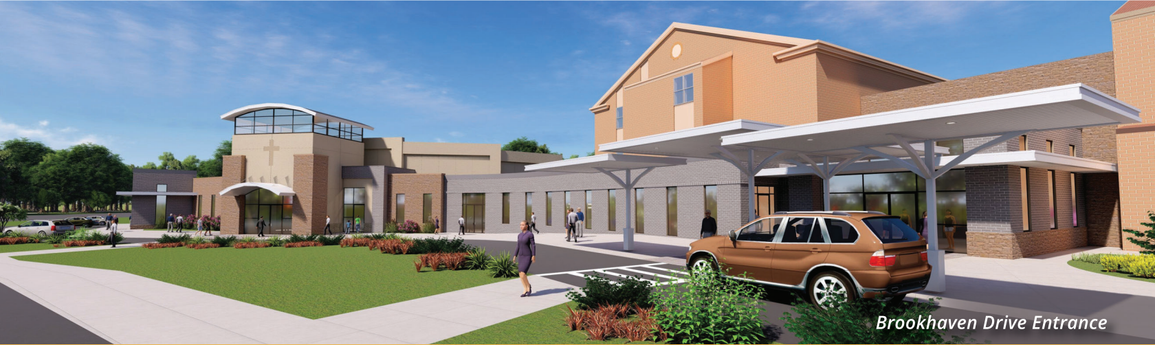
Brookhaven Drive Entrance