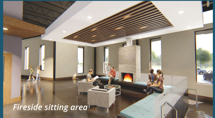
Fireside sitting area