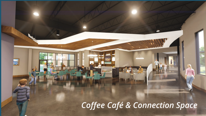
Coffee Café & Connection Space