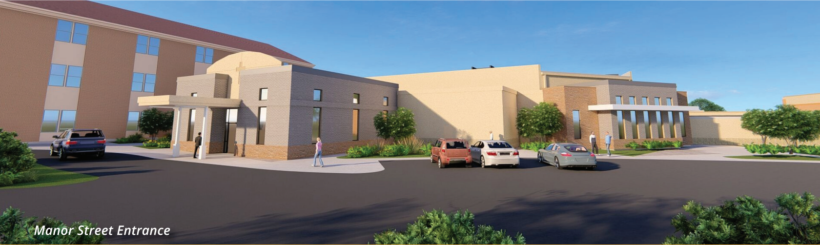
Manor Street Entrance